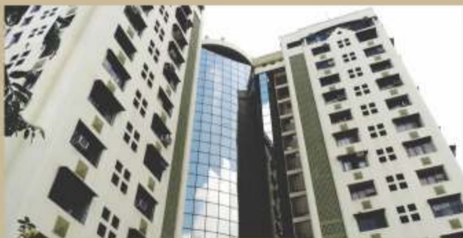
Meenakshi Tower, Goregaon East