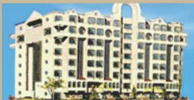
Meenaxi Apartments, Goregaon East

Shree Shakun Realty P. Ltd, one of Mumbai's leading Real Estate developers, has over the last 20 years set new standards in creating luxurious apartments and premium commercial realty. Developing property that inspires trust and confidence, the company has successfully completed a wide array of projects at prime locations in the suburbs of the city