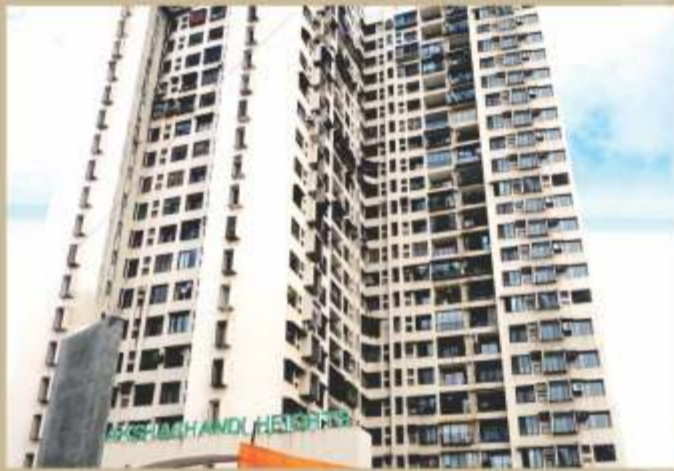
Lakshachandi heights, Goregaon East