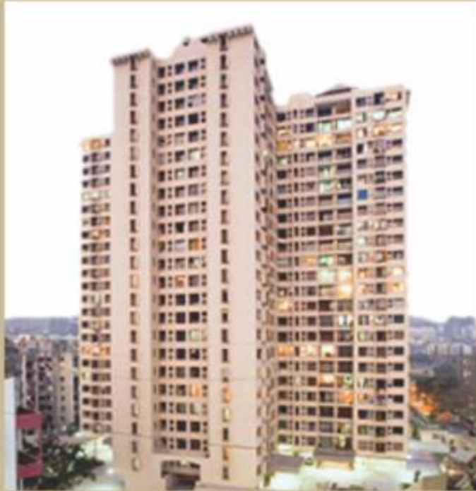
Lakshachandi Apartments, Goregaon East